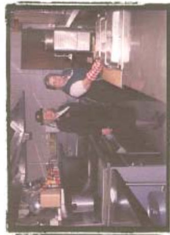
Tables at the Salvation Army display their remodeled kitchen.