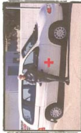
Red Cross volunteer poses with the donated van.

Remembering us in your will or when you do your estate planning is another way of contributing to our community. Some families also choose to encourage gifts to the Santa Monica Rotary Club Foundation in lieu of flowers when a loved one passes away.