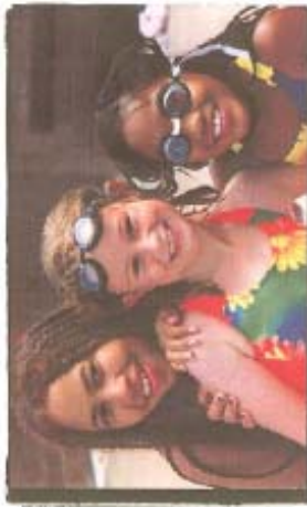
Smiles from the children of the Boys & Girls Club of Santa Monica.