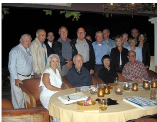
Induction ceremony for new members; a Fireside Orientation to provide a solid foundation of information and understanding