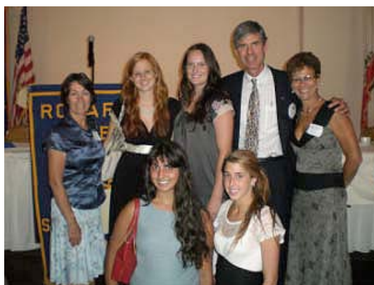
Interactors take over a club meeting!