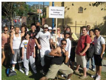
Rotaractors...on campus and taking over a Rotary Club meeting...