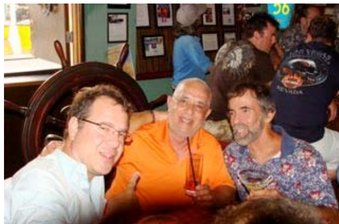
Bending an elbow or two, sharing stories, making friends with fellow club members in an organized, monthly, after-work group.