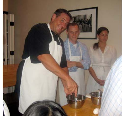
Wine tasting, the Getty Villa, and learning to be a chef at cooking school...