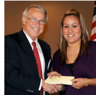
Scholarships recognize academic excellence, community service, and citizenship