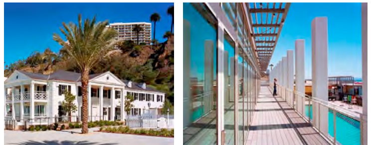
Annenberg Beach House