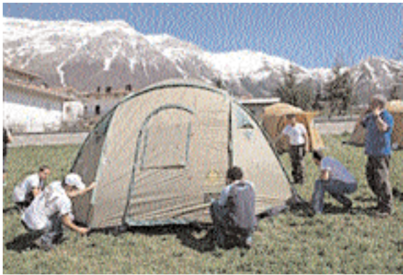
Volunteers assemble a ShelterBox tent in Assergi, Italy, after the country's worst earthquake in decades left tens of thousands homeless on 6 April.

Hours after a powerful earthquake struck central Italy on 6 April, killing nearly 300 people, a team of ShelterBox volunteers reached the affected areas to distribute 245 containers of relief supplies to hundreds of displaced families.